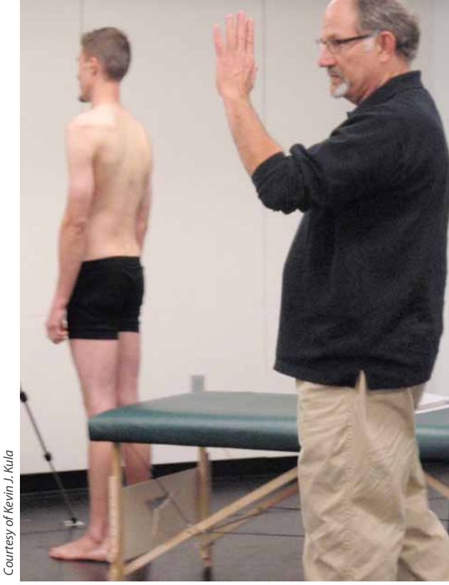
Pre- and post-session assessment.